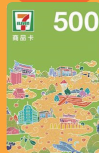
7-11 NTD$500 gift voucher The first 100 respondents to complete the survey