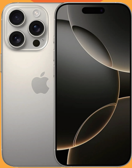
iPhone 16 128G 1 winner