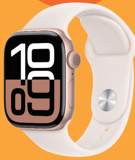
Apple Watch S10(42mm) 1 winner