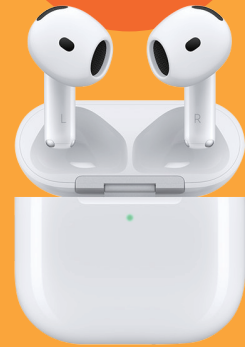
AirPods 4 1 winner