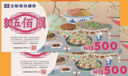
Px Mart NTD$1,000 gift voucher 10 winners